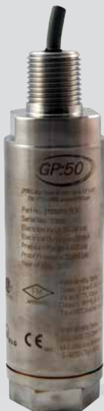
Models 111X/P, 211X/P, 311X/P & 311N/AN/GN Explosion Proof & Zone 2/Div 2 Pressure Transmitter