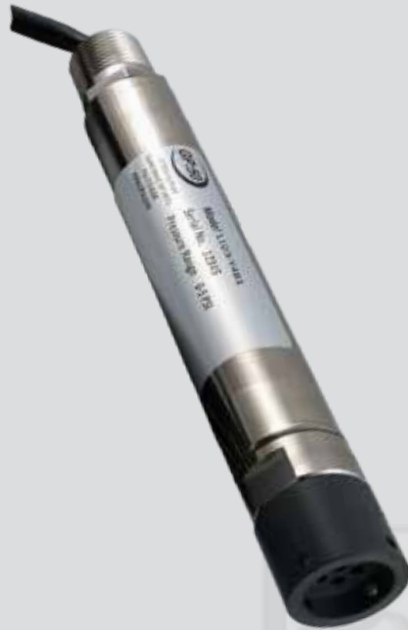
Model 1103-Y481 Submersible Level Transmitter