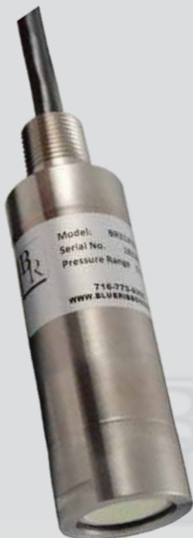
Model BR313F Flush Submersible Level Transmitter