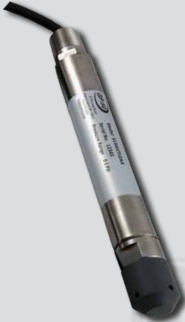
Model 313AI Submersible Level Transmitter for Hazardous Locations